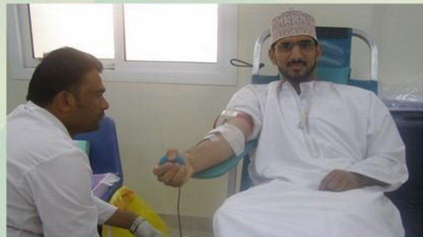
What A Way To Save Life!

The finest gesture one can make is to save life by donating Blood. Community Service committee encouraged students and staff to participate in the Blood Donation Drive organized by a team from the Central Blood Bank, at Blood Services Department of the General Directorate of Health Affairs. The team collected blood units from the staff and students on Tuesday 14 October 2014.