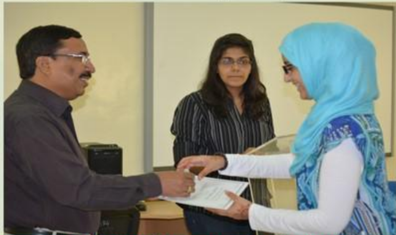
The Day Dawns for the Artists!