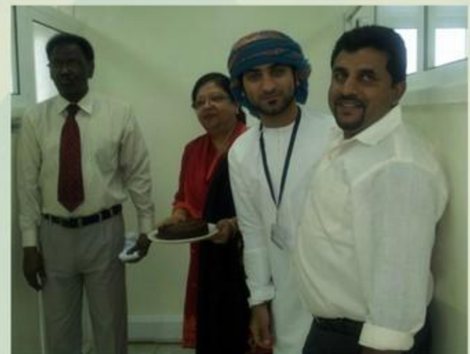
A Competent Teacher; Farewell