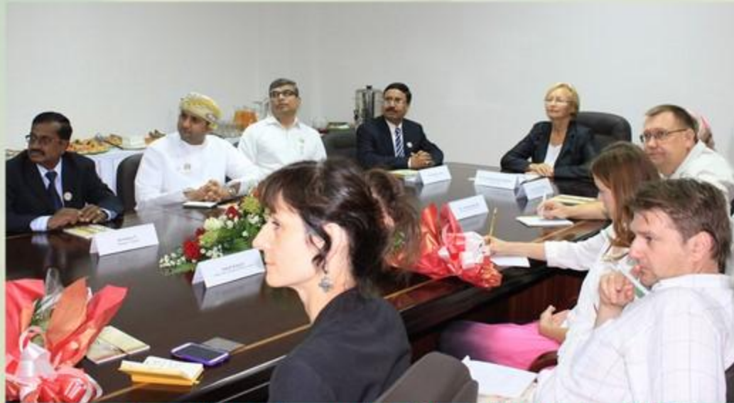
Great Possibilities Discussed At The Polish Ministerial Visit