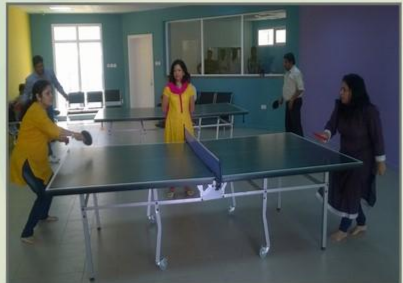
We Refresh Our Minds

The winners and runner ups in each category are: