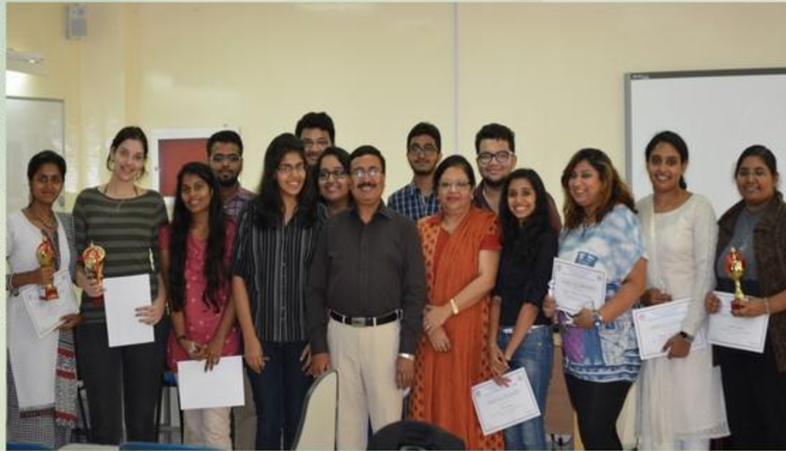
College Offering Great Scope For Creativity