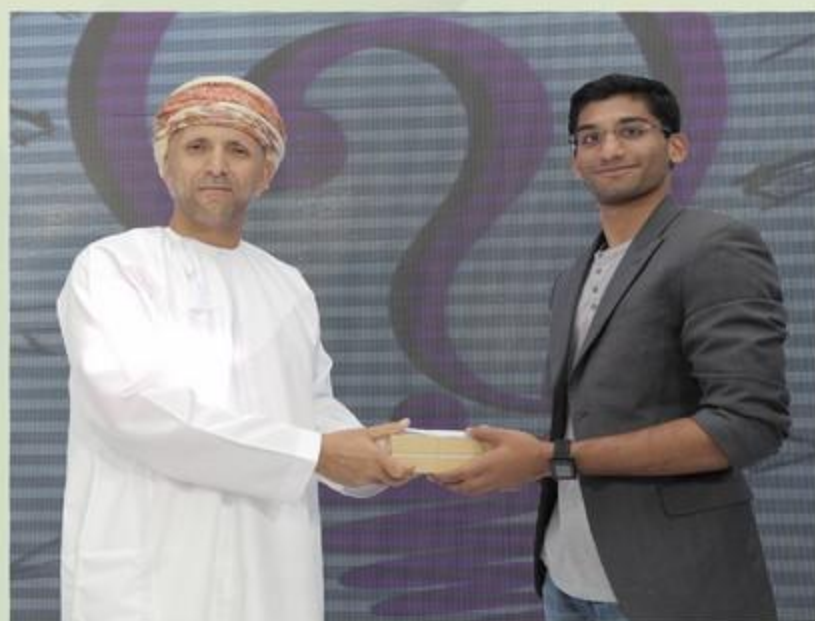
Best Idea Award

In the coming months, the team hopes to tie up with local authorities in Oman's entrepreneurial sphere and officially launch the platform at a national and global scale.