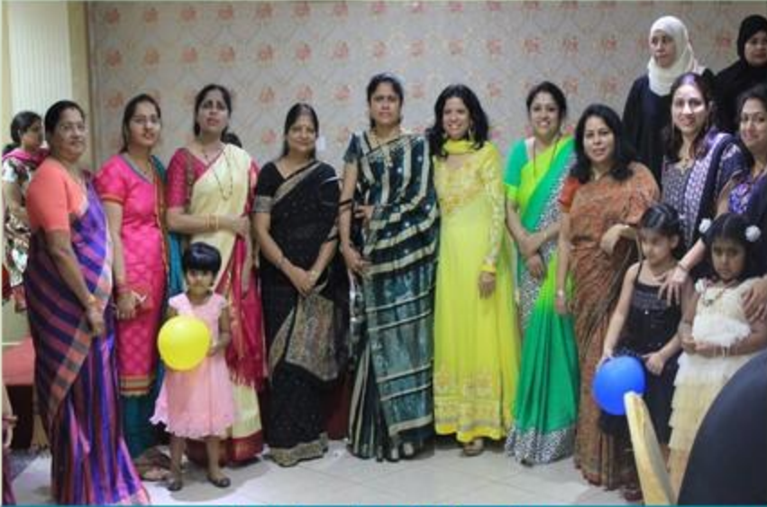
Celebrations Bring Joy

Faculty and Staff of Waljat College Celebrated Eid Al Fitr with a Gala dinner organized on 19th September, 2014 at Moti Mahal.