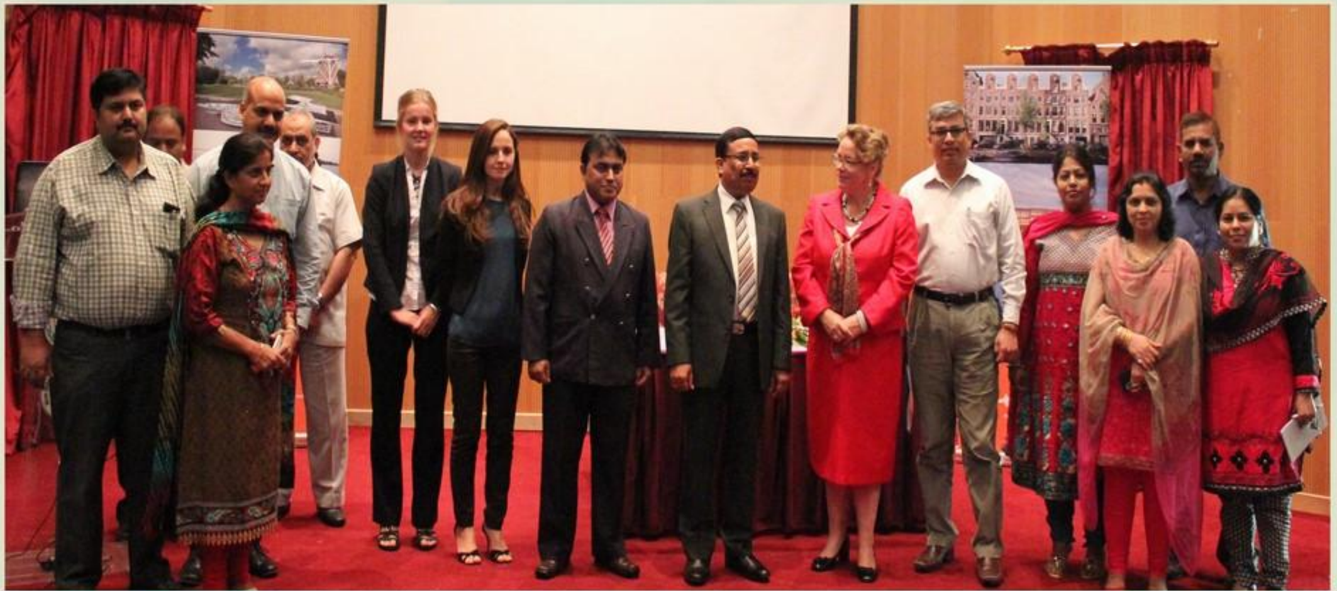
The Ambassador discussing academic opportunities