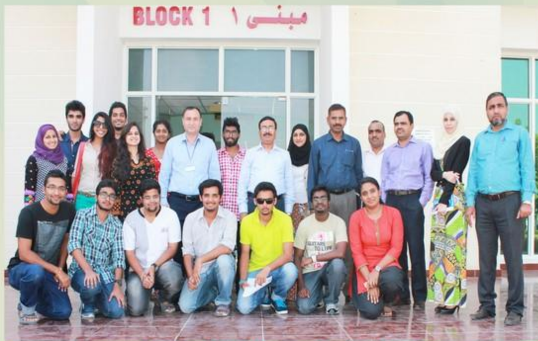
Getting A Taste Of Election And Public Service

The annual election of WCAS students' council was held on Wednesday, 16th October 2014. Student Affairs Manager in coordination with the Professor-In-Charge of student Activities took the responsibility of preparing, organizing and facilitating the voting process. Students from all the disciplines took part in the elections. As closing time for the election was extended to the afternoon hours, a number of part-time students also took part in the voting. The following students were duly elected for the post mentioned against each: