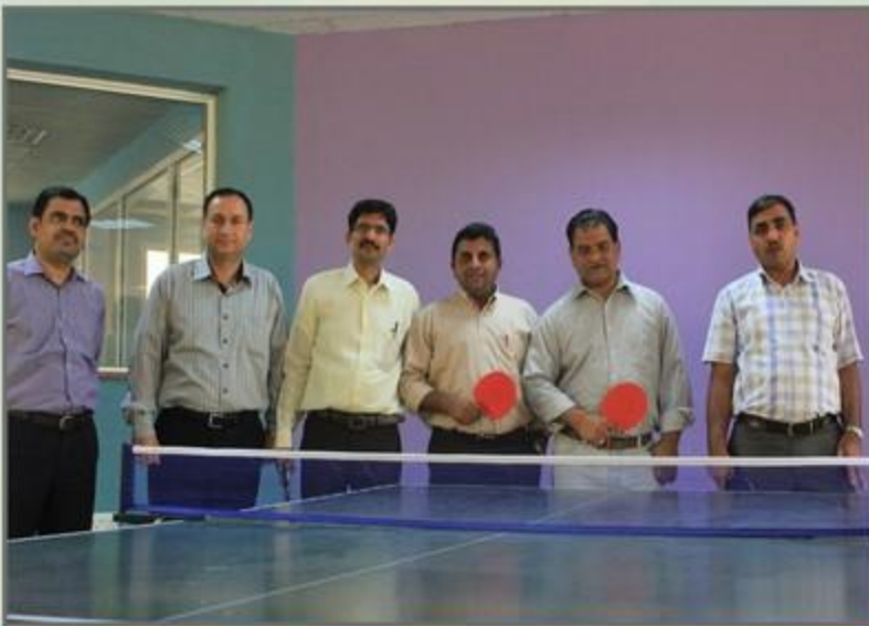
We Show Our Talents

A total of twelve participants for men's singles were divided into three groups, for men's doubles there were three teams, for women's singles the total number of participants were four and for mixed doubles only two teams opted.