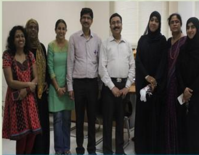
A Great Efforts Well Appreciated!