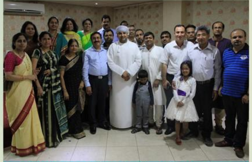
Celebrations Bring Our Families Together