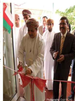
Photographic Club WCAS