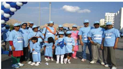
Faculty members of WCAS joining the diabetic walkathon

The Landmark Group organized the second annual "Beat Diabetes Walkathon Oman" under the auspices of the Ministry of Health and the Oman Diabetes Association on 25th November 2011.