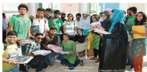
Students with collected papers for recycling