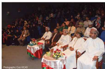
Photographic Club WCAS