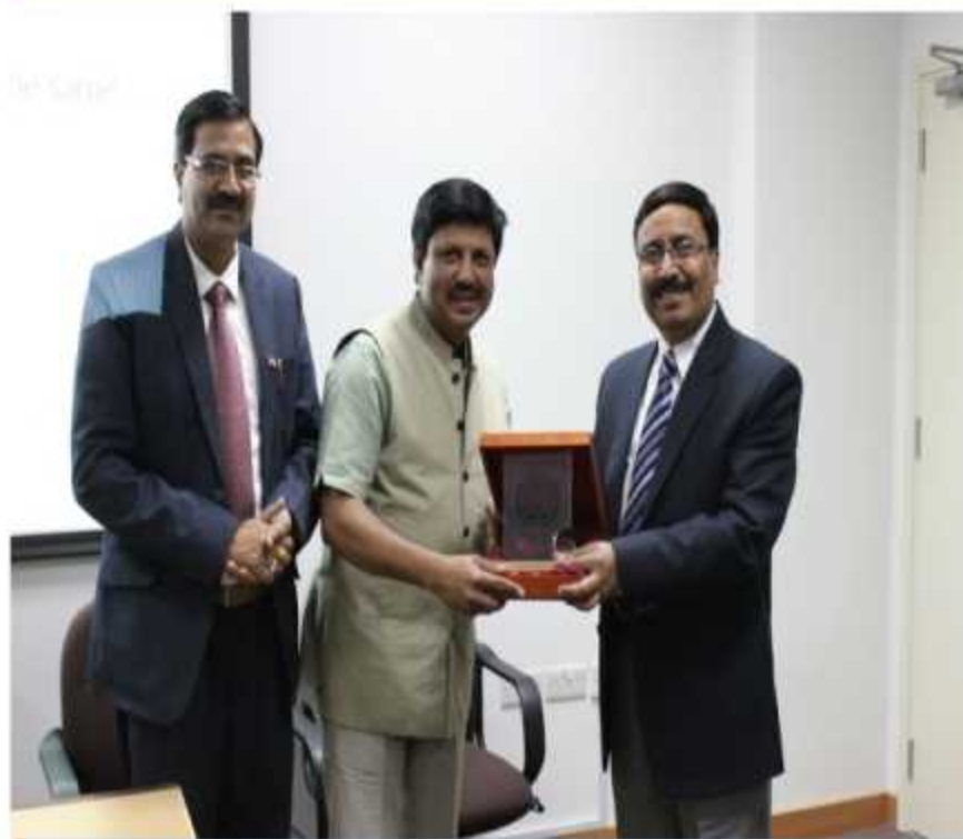
MEMENTO FOR SOME VALUABLE LECTURES