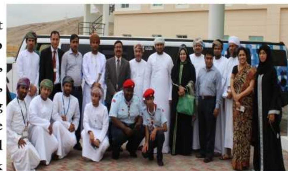
OPEN-DAY CELEBRATION AT WCAS