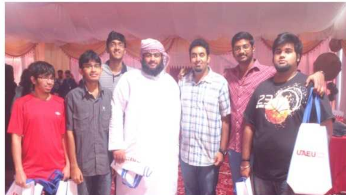
WCAS STUDENTS AT SQU