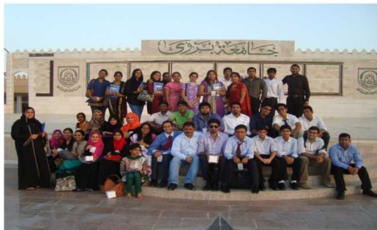
Team WCAS participated in 3rd National Symposium on Engineering Final Year Projects

It is the sincere effort of the students under the guidance of the faculty members that is the secret behind this success.