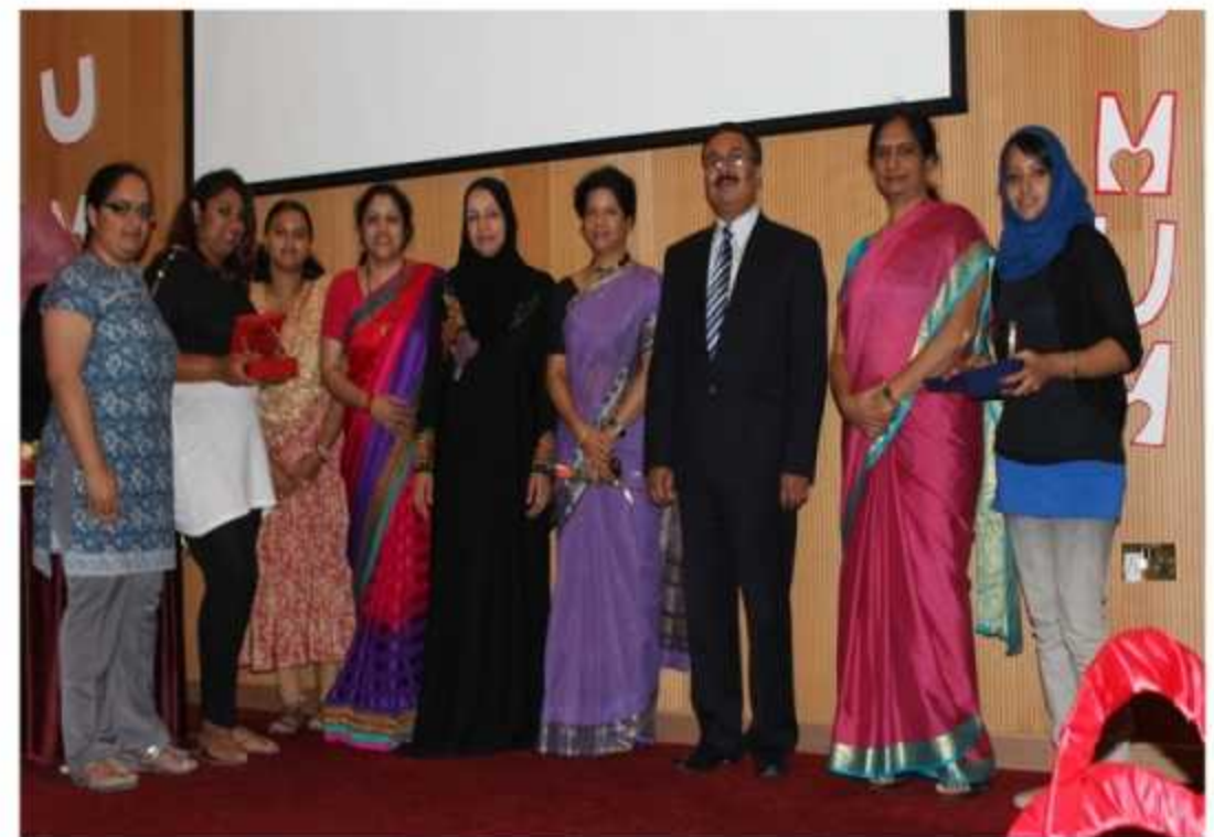
ENHANCING STUDENTS' AWARENESS OF WCAS VALUES