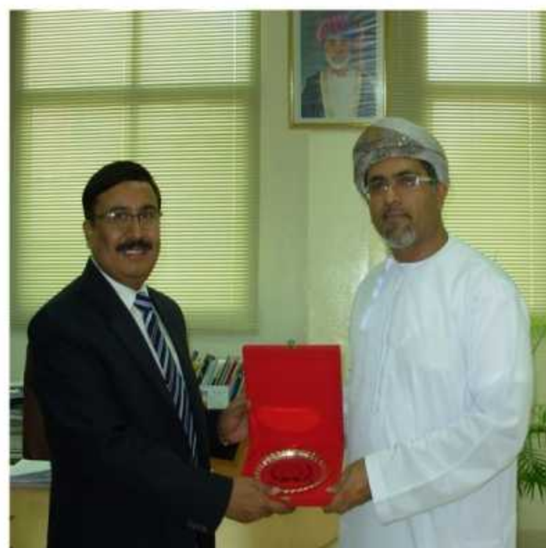
A SOURCE OF INFORMATION FROM PDO; HONORED BY DEAN