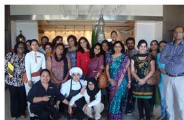
How Better Can We Serve?