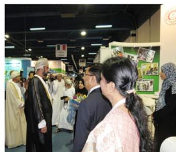
Visitors Are Well Inspired!

The prime focus of this event is to focus on the quality of education by inviting accredited universities and colleges to participate and showcase their programmes and curriculum to the prospective students of this country. This year over 175 Universities from 25 countries exhibited at GHEDEX. Despite bad weather, many visitors visited the WCAS stall. They showed keen interest in our programs. Most of the parents discussed with us the Engineering programs and Master Degree Programs.