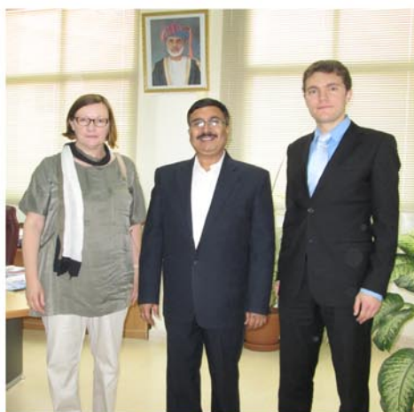
Challenges Can Be Diverse But Together We Solve!