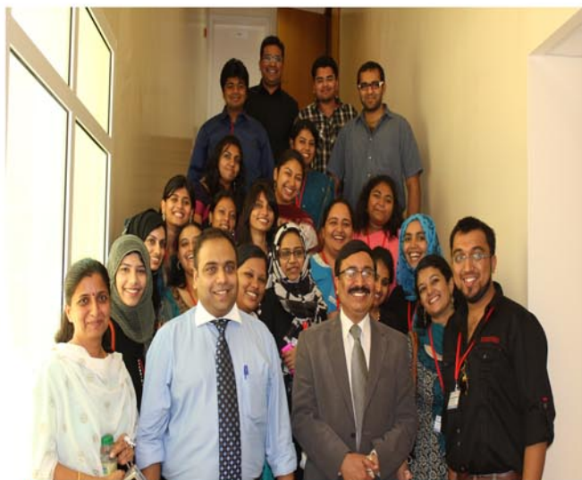
Waljat Has Made Us Smile !