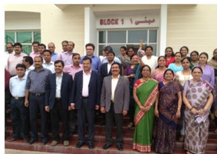
Enlightenment Academicians Brightening Our Faculty!