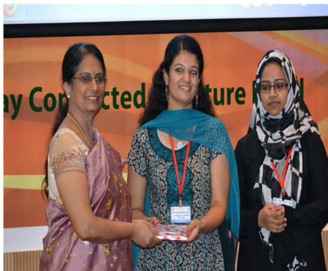
Prizes Were Won Too.

In an endeavor to facilitate building and strengthening relationships with its alumni, WCAS launched 'Alumnee', the ERP instance dedicated to college alumni to provide an effective platform for its graduates to be in touch with current students as well as with faculty members. About sixty graduates have registered on the alumni portal so far. The highlight of the event was a film showcasing college infrastructure and glimpses of campus life followed by an interactive session arranged for alumni and college staff, which provided opportunity for experience sharing as well as revival of past memories. This annual event is one amongst the several channelized efforts made by the college to nurture and strengthen bond with its brand ambassadors.