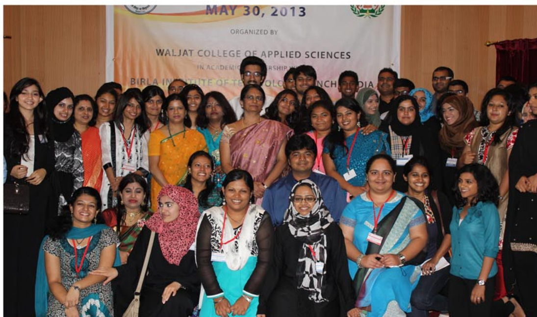
What A Joy To Be At Home !

In an endeavor to facilitate building and strengthening relationships with its alumni, WCAS launched 'Alumnee', the ERP instance dedicated to college alumni to provide an effective platform for its graduates to be in touch with current students as well as with faculty members. About sixty graduates have registered on the alumni portal so far. The highlight of the event was a film showcasing college infrastructure and glimpses of campus life followed by an interactive session arranged for alumni and college staff, which provided opportunity for experience sharing as well as revival of past memories. This annual event is one amongst the several channelized efforts made by the college to nurture and strengthen bond with its brand ambassadors.