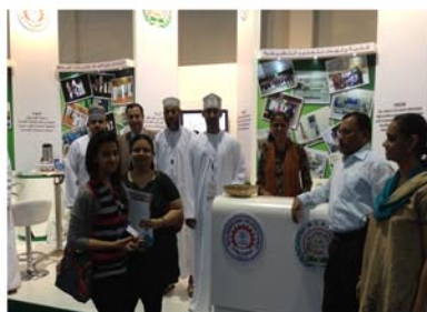
Our Academic Programmes Well Portrayed In GHEDEX.