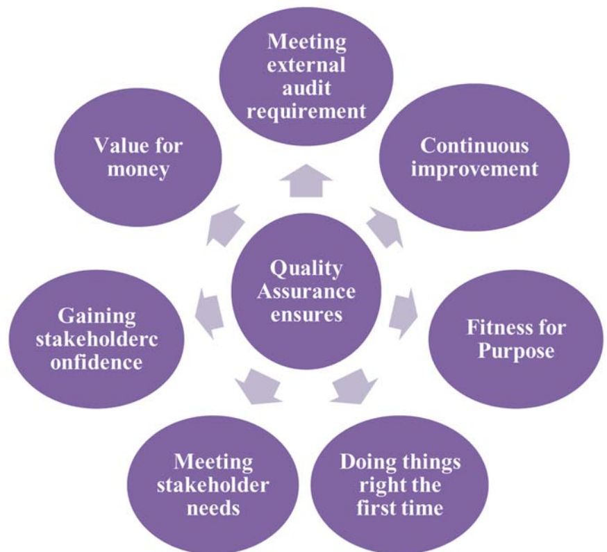
Fig 1: What is Quality Assurance?

Higher Education is vital for the progress of a country. Students are the center of a Higher Education Institution. A quality higher education is central to Oman's social and economic development. Quality in Higher Education enables students' to achieve their goals thereby meeting the needs of the society.