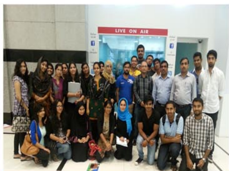
Sharing The Joy Of Connecting With People