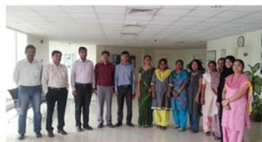
Quiet & Studious Leaves- A Model To Emulate