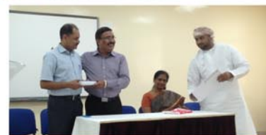
An Excellent Career Taken To Another Centre!