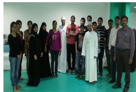
In Touch With People Who Are In Touch