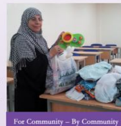
For Community – By Community

The WCAS staff contributed food items, clothes, books, & toys, etc. during Ramadan. The items were collected and handed over to an Al-Khoud based charity organization on September 11, 2012, to distribute the collections amongst the needy people.