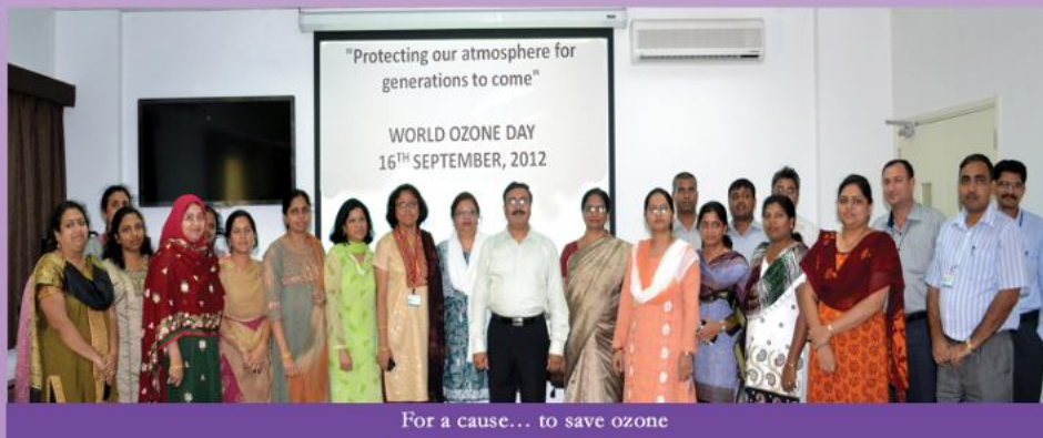
For a cause... to save ozone