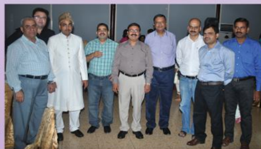
The great get-together