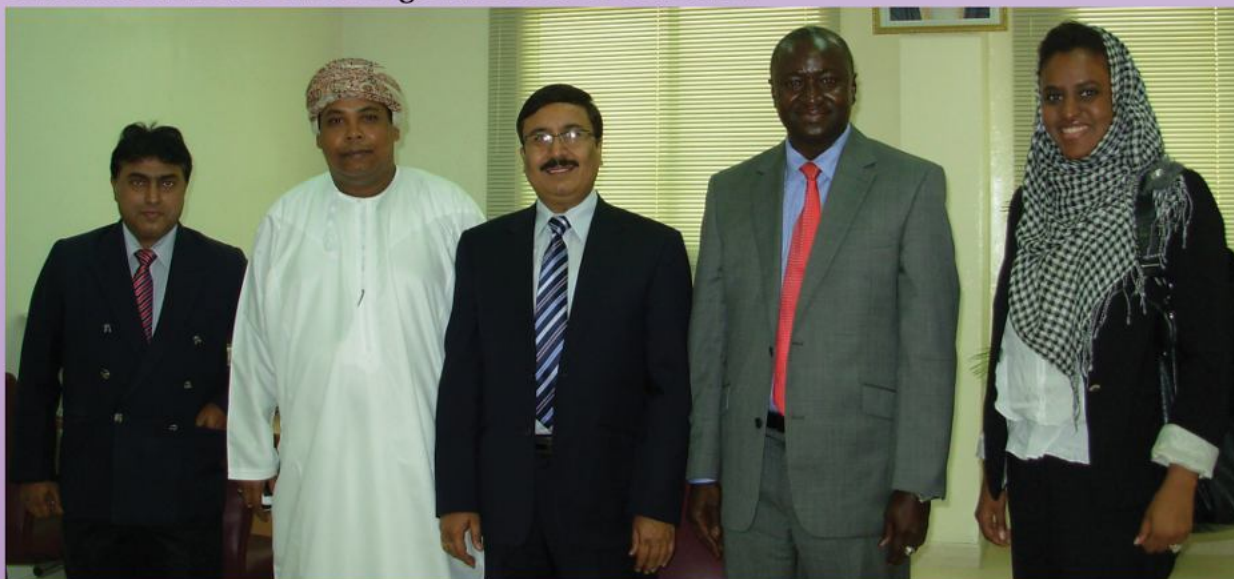
From Academia to Industry : A path growing

After the informative and interactive session, the students asked questions about career paths in Standard Chartered Bank, Islamic Banking scenario, the future of banking in Oman, prospects for job applicants, and how Standard Chartered Bank over came the global economic downturn.