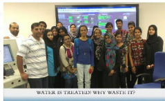
WATER IS TREATED! WHY WASH IT?