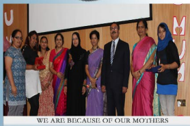
WE ARE! BECAUSE! OF! OUR! MOTHERS