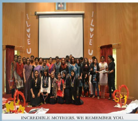
INCREDIBLE MOTHERS. WE REMEMBER YOU.