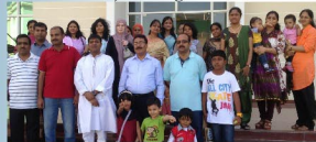
WCAS FAMILY IN CELEBRATION MOOD AT HOLI

Faculty and staff of Waljat College celebrated Holi with a gala lunch organized on 29th March, 2013.