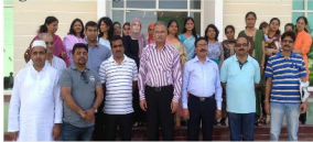
WE NEED LIGHTER MOMENTS TOO AT HOLI PARTY