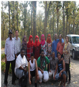
NATURE IS AT ITS BEST AT RANCHI BUT A FEW ARE PRIVILEGED TO BE A PART OF IT