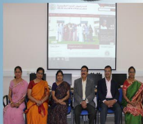
DEAN AT THE LAUNCHING SESSION

For more information, check out the website at http://www.waljatcollege.edu.om/