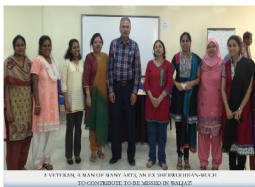
A FAREWELL A MAN OF MANY SETS, AN EX-GRADUATE WHO WANTED TO CONTRIBUTE TO BE MERGED IN WALJAT