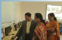
OPENING OF OUR NEW WEBSITE