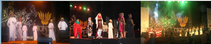
CULTURAL EVENT AT RANCHI