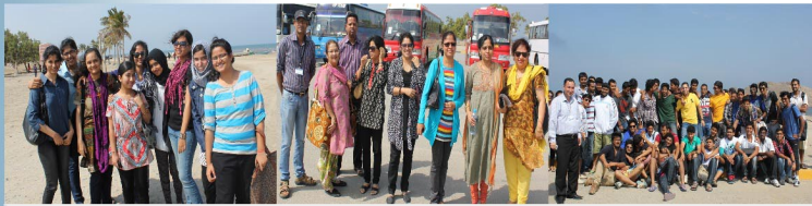
WCAS STAFF & STUDENT'S STRETCHING THEMSELVES AT AL-SAWADI

A College picnic was organized by the Social club of Waljat College of Applied Sciences on 20th Feb, 2013. About 265 students took a day off from their routine in classrooms to enjoy enthusiastically at Al-Sawadi Beach. They had a fun filled day with boating, playing beach ball, football match, rock climbing, music, antakshari etc. The day concluded with a sumptuous meal of Biryani and the group was back to college by 4 P.M.