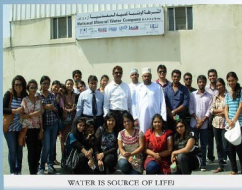
WATER IS SOURCE OF LIFE!