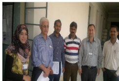
WCAS STAFF WITH RANCHI STAFF