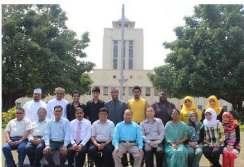
JUBILANT WCAS PARTICIPANTS WITH HONORABLE VICE-CHANCELLOR